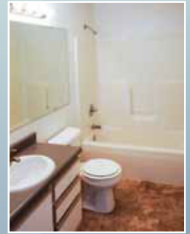
One and two-bath units