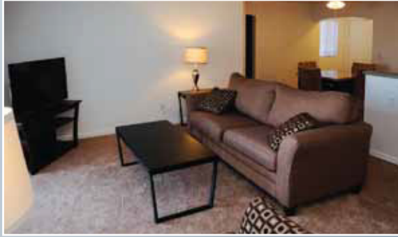
Floor plans range from 600 - 1346 SF