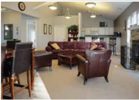
Clubhouse for resident events