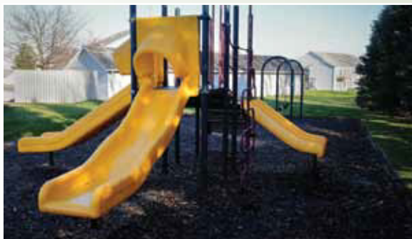
Playground and pool