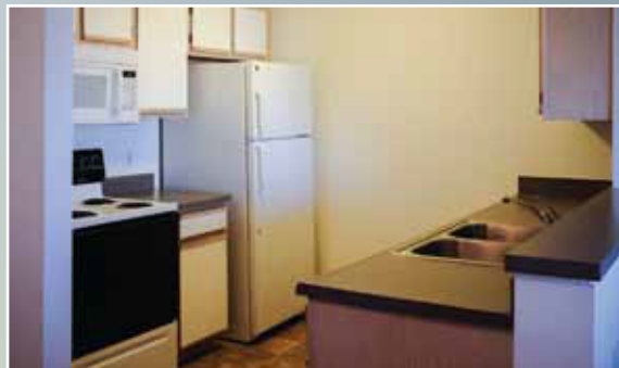
Dishwasher, stove, refrigerator, and garbage disposal