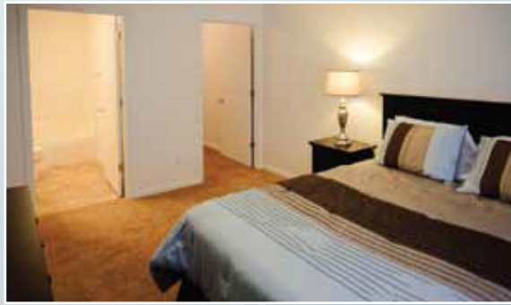
One, two, and three-bedroom units