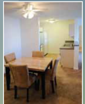
Spacious apartment homes