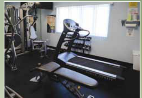
24-hour fitness center