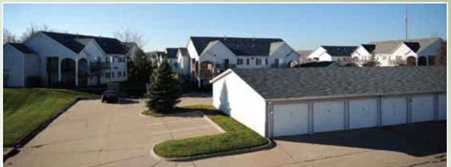
Free parking | Garages available for rent; month-to-month