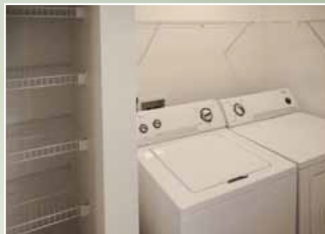
In-unit washer and dryer